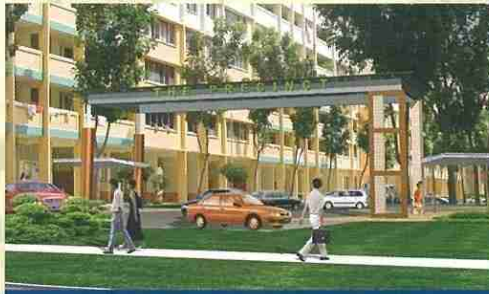
IUP Plus at Blk 238 - 246 Serangoon Ave 2/3