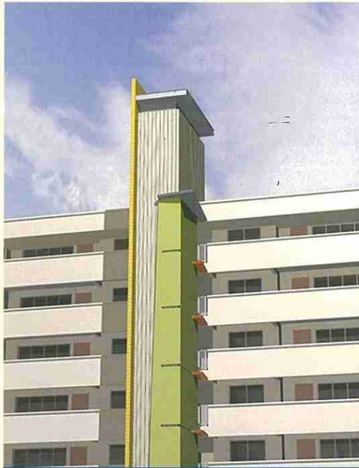
IUP Plus at Blk 238 - 246 Serangoon Ave 2/3