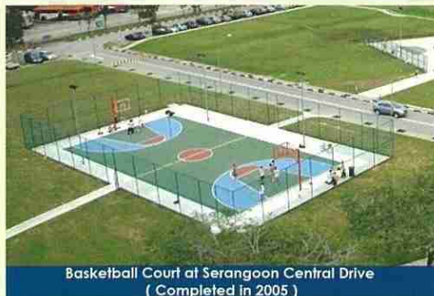
Basketball Court at Serangoon Central Drive ( Completed in 2005 )