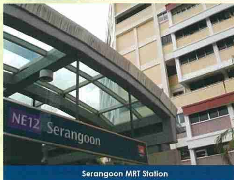
Serangoon MRT Station