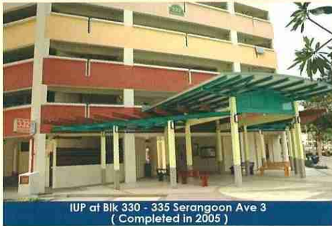
IUP at Blk 330 - 335 Serangoon Ave 3 ( Completed In 2005 )