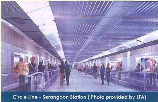
Circle Line - Serangoon Station