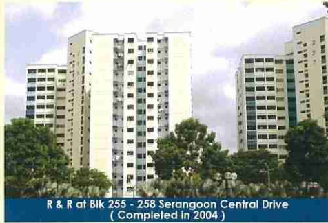
R & R at Blk 255 - 258 Serangoon Central Drive ( Completed In 2004 )