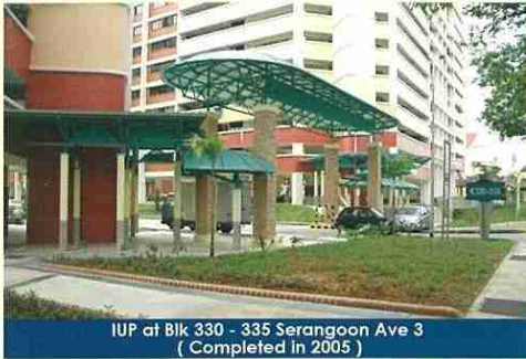
IUP at Blk 330 - 335 Serangoon Ave 3 ( Completed In 2005 )