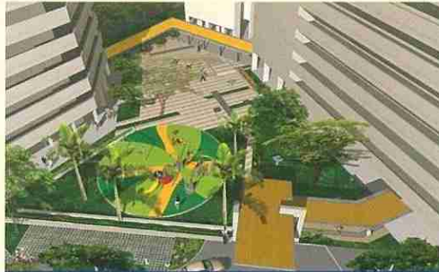
IUP Plus at BLK 238 - 246 Serangoon Ave 2/3