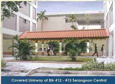
Covered Linkway at Blk 412 - 413 Serangoon Central