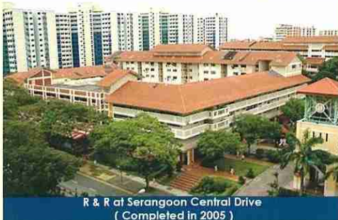
R & R at Serangoon Central Drive ( Completed in 2005 )