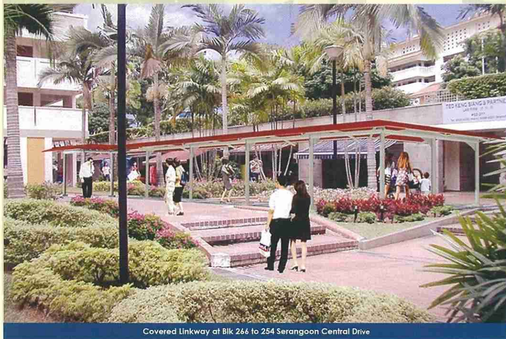
Covered Linkway at Blk 266 to 254 Serangoon Central Drive