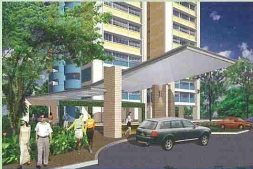
IUP Plus at Blk 125 & 126 Aljunied Road