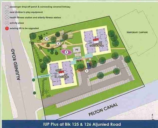
IUP Plus at Blk 125 & 126 Aljunied Road