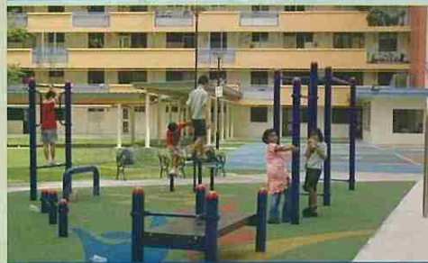
Fitness Corner at Blk 36 Circuit Road ( Completed in 2005 )