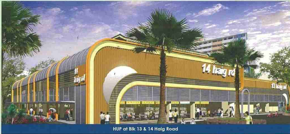
HUP at Blk 13 & 14 Haig Road