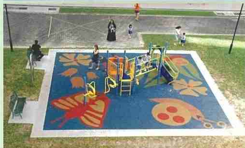
Children's Playground at Blk 31 Balam Road ( Completed in 2005 )