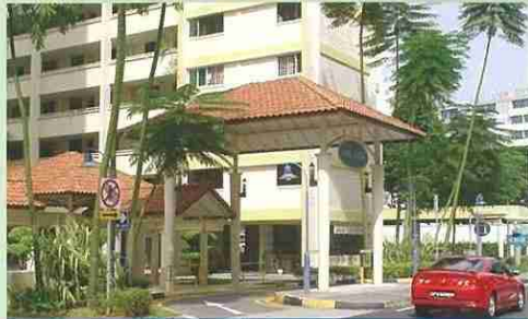
IUP at Blk 21 - 23 Haig Road ( Completed In 2003 )