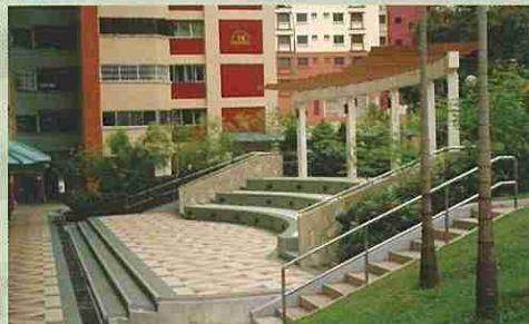
IUP at Blk 12 - 18 Joo Seng Road ( Completed In 2004 )