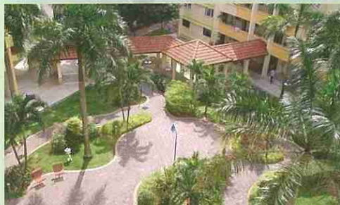
IUP at Blk 21 - 23 Haig Road ( Completed In 2003 )