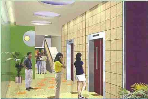
IUP Plus at Blk 125 & 126 Aljunied Road