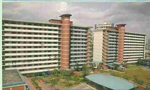
MUP at Blk 81 - 83 MacPherson Lane ( Completed in 2003 )