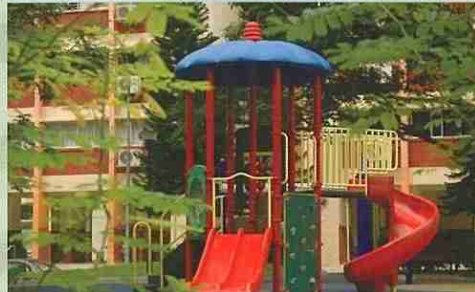
Children's Playground at Blk 15 Joo Seng Road ( Completed in 2003 )