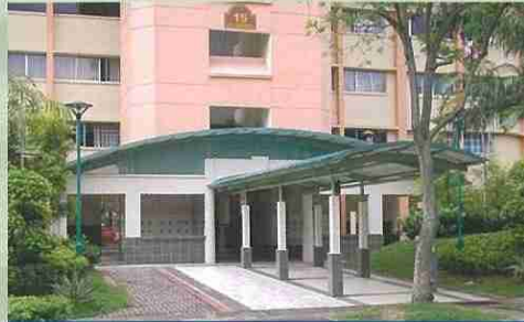
IUP at Blk 12 - 18 Joo Seng Road ( Completed In 2004 )