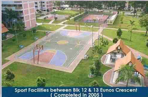
Sport Facilities between Blk 12 & 13 Eunos Crescent ( Completed in 2005 )