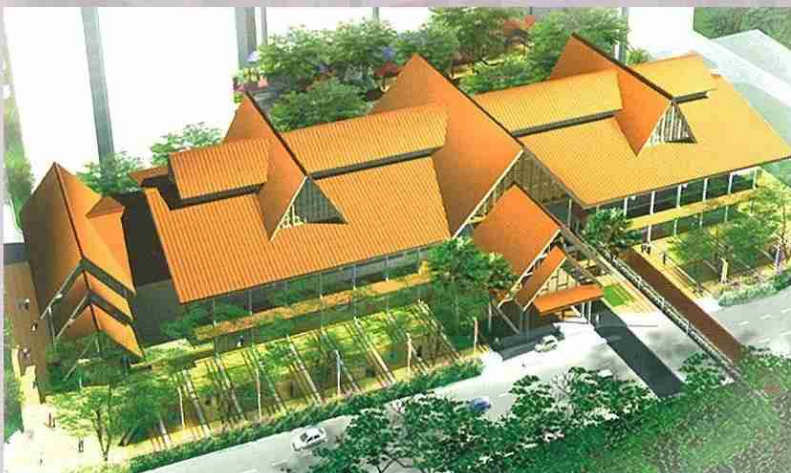
Rebuilding of Geylang Serai Market