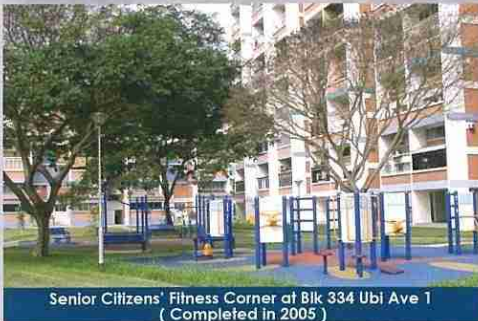
Senior Citizens' Fitness Corner at Blk 334 Ubi Ave 1 ( Completed in 2005 )