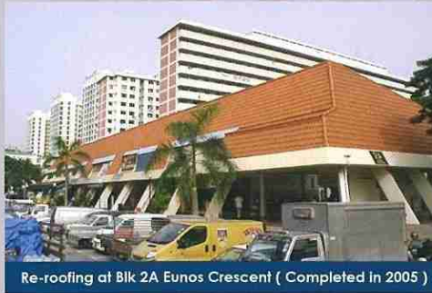
Re-roofing at Blk 2A Eunos Crescent ( Completed in 2005 )