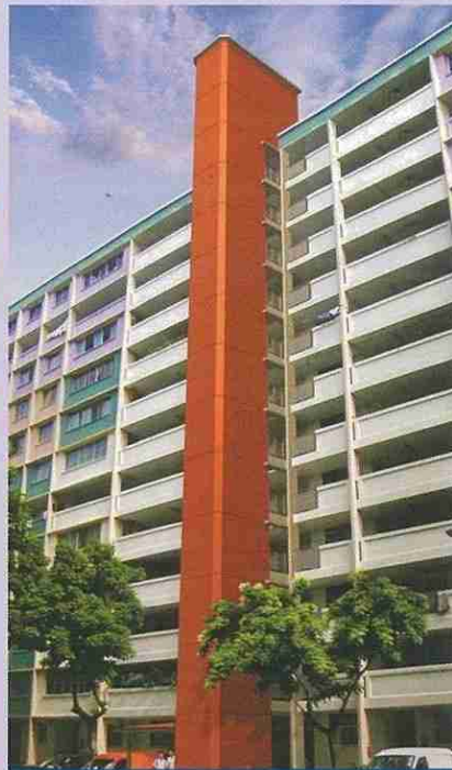
IUP Plus at Blk 319 - 330 Ubi Ave 1