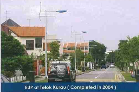
EUP at Telok Kurau ( Completed in 2004 )