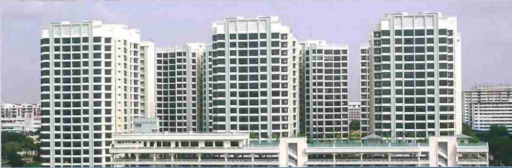
New Blocks at Blk 31 - 36 Eunos Crescent with a Multi-storey Carpark ( Blk 31A ) ( Completed In 2006 )