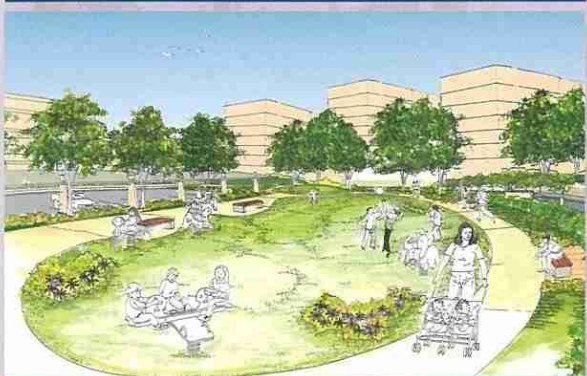
Jogging Track at Eunos Crescent