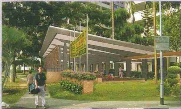
IUP Plus at Blk 319 - 330 Ubi Ave 1