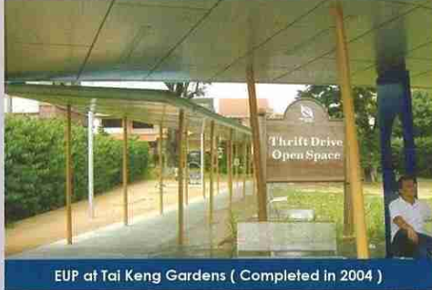
EUP at Tai Keng Gardens ( Completed in 2004 )