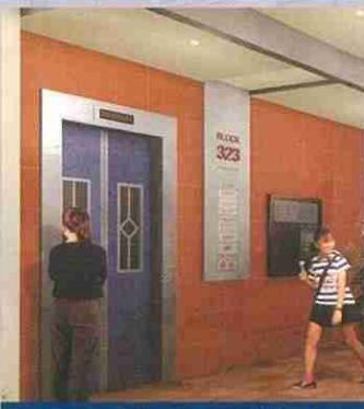
IUP Plus at Blk 319 - 330 Ubi Ave 1